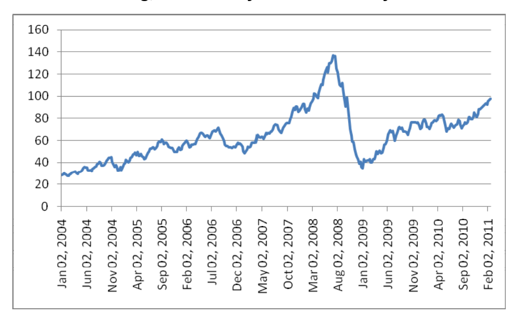
Price in dollars per barrel of West Texas Intermediate (WTI) Crude Oil Cushing, OK: January 2004 to February 2011