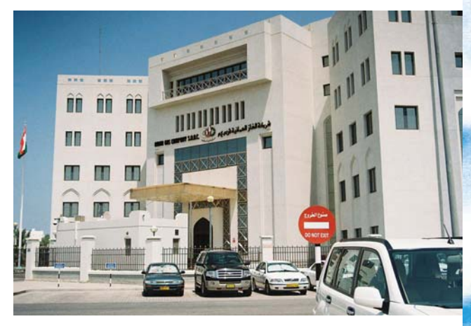
Oman Gas Company